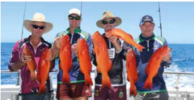
DEPARTING FROM AIRLIE BEACH, WHITSUNDAYS QUEENSLAND, AUSTRALIA

Discover the very heart of the iconic Great Barrier Reef. Be guided by our highly experienced crew and fish some of the most remote, complex Coral Reef systems of the Outer Great Barrier Reef and Coral Sea.