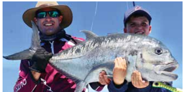
THE HEART OF THE GREAT BARRIER REEF

Discover the very heart of the iconic Great Barrier Reef. Be guided by our highly experienced crew and fish some of the most remote, complex Coral Reef systems of the Outer Great Barrier Reef and Coral Sea.